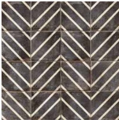
Peak Caviar NATVIVPEACAV99G 9"x9" Pressed Porcelain Deco - Gloss