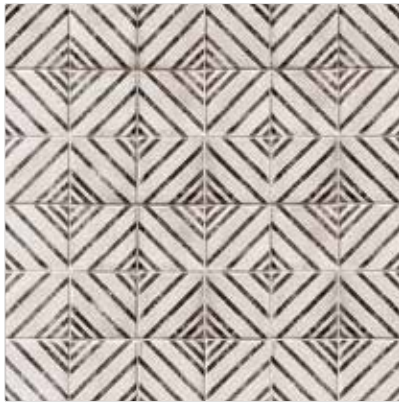
Motif Rice NATVIVMOTRIC44G 4"x4" Pressed Porcelain Deco - Gloss