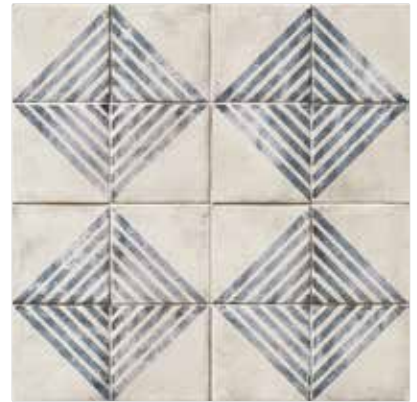
Roads Atlantic NATVIVROAATL99M 9"x9" Pressed Porcelain Deco - Matte