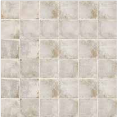
Fossil - FOS NATVIVFOS44G 4"x4" Pressed Porcelain Field Tile - Gloss