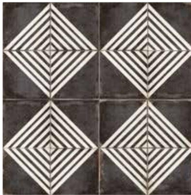
Roads Caviar NATVIVROACAV99M 9"x9" Pressed Porcelain Deco - Matte