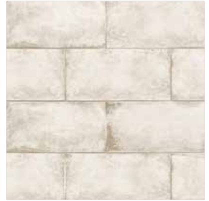
Rice - RIC NATVIVRIC918M 9"x18" Pressed Porcelain Field Tile - Matte