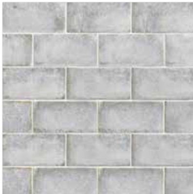
Atlantic - ATL NATVIVATL49G 4"x9" Pressed Porcelain Field Tile - Gloss