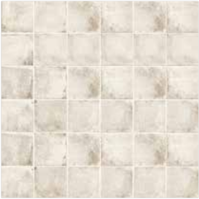
Rice - RIC NATVIVRIC44G 4"x4" Pressed Porcelain Field Tile - Gloss