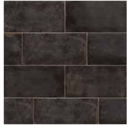
Caviar - CAV NATVIVCAV918M 9"x18" Pressed Porcelain Field Tile - Matte