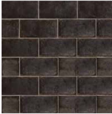
Caviar - CAV NATVIVCAV49G 4"x9" Pressed Porcelain Field Tile - Gloss