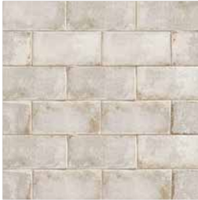
Fossil - FOS NATVIVFOS49G 4"x9" Pressed Porcelain Field Tile - Gloss