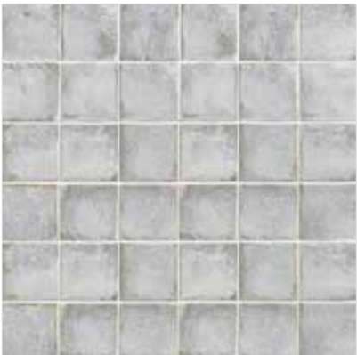
Atlantic - ATL NATVIVATL44G 4"x4" Pressed Porcelain Field Tile - Gloss