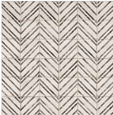
Incline Rice NATVIVINCRIC44M 4"x4" Pressed Porcelain Deco - Matte