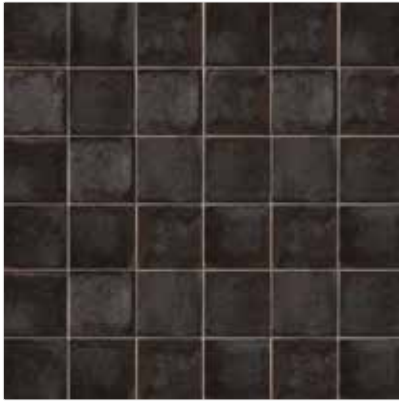
Caviar - CAV NATVIVCAV44G 4"x4" Pressed Porcelain Field Tile - Gloss