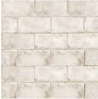
Rice - RIC NATVIVRIC49G 4"x9" Pressed Porcelain Field Tile - Gloss