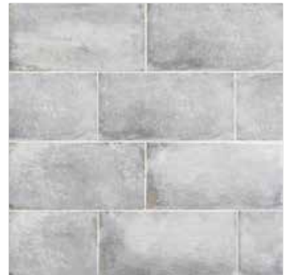
Atlantic - ATL NATVIVATL918M 9"x18" Pressed Porcelain Field Tile - Matte