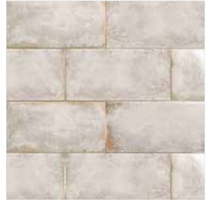
Fossil - FOS NATVIVFOS918M 9"x18" Pressed Porcelain Field Tile - Matte