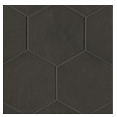
Black - BLA DECALLBLAHEXM 8 1/2"x10" Non-Rectified Hexagon Field Tile - Matte