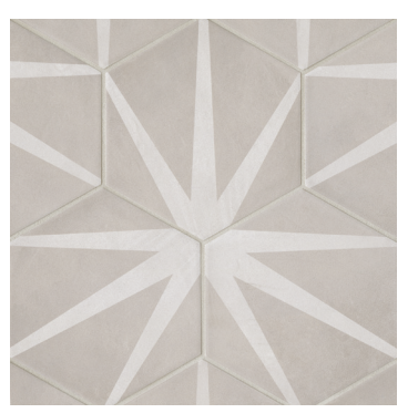
DECALLSTEDECOM 8 1/2"x10" Non-Rectified Stella Hexagon Deco - Matte