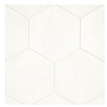
White - WHI DECALLWHIHEXM 8 1/2"x10" Non-Rectified Hexagon Field Tile - Matte