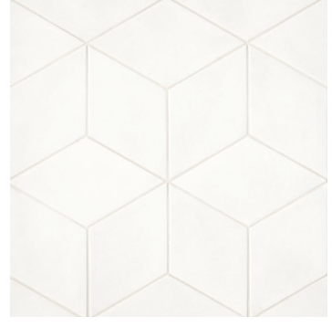
White - WHI DECALLWHIRHOM 7 3/8"x12 3/4" Non- Rectified Rhomboid Field Tile - Matte