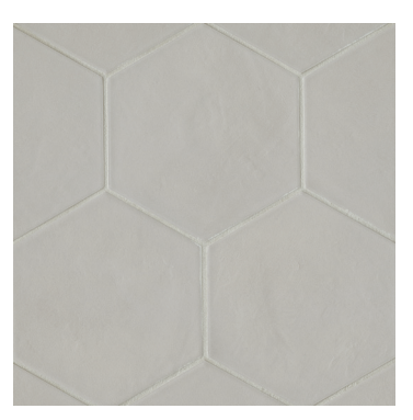
Grey - GRE DECALLGREHEXM 8 1/2"x10" Non-Rectified Hexagon Field Tile - Matte