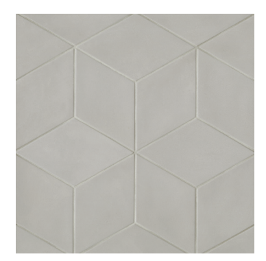
Grey - GRE DECALLGRERHOM 7 3/8"x12 3/4" Non- Rectified Rhomboid Field Tile - Matte