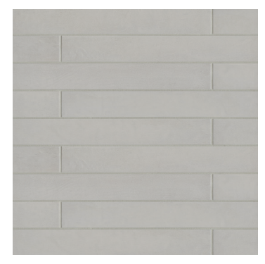
Grey - GRE DECALLGRE324M 3"x24" Non-Rectified Field Tile - Matte