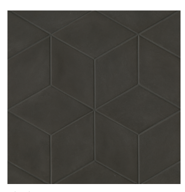
Black - BLA DECALLBLARHOM 7 3/8"x12 3/4" Non- Rectified Rhomboid Field Tile - Matte