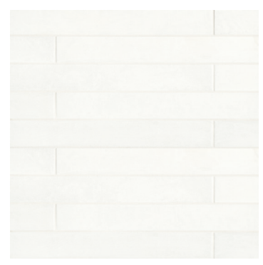
White - WHI DECALLWHI324M 3"x24" Non-Rectified Field Tile - Matte