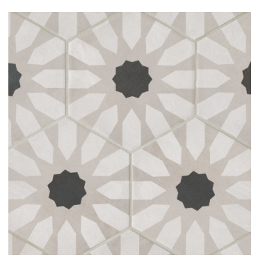
DECALLFIODECOM 8 1/2"x10" Non-Rectified Fiore Hexagon Deco - Matte