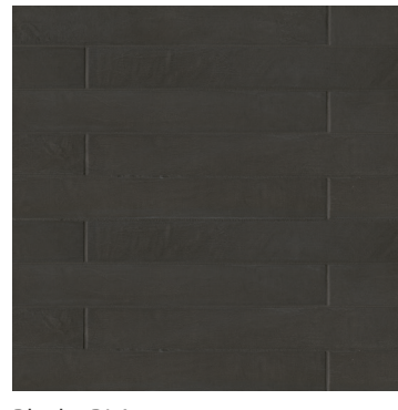
Black - BLA DECALLBLA324M 3"x24" Non-Rectified Field Tile - Matte