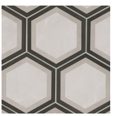
DECALLTELDECOM 8 1/2"x10" Non-Rectified Telaio Hexagon Deco - Matte